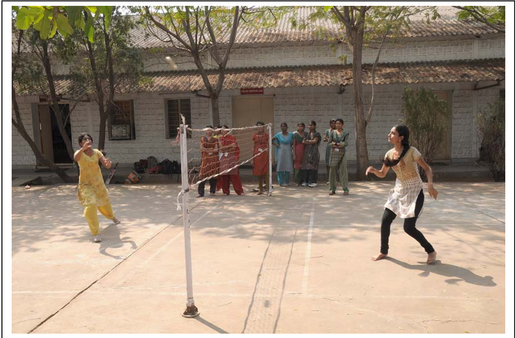
Outdoor Sports facilities