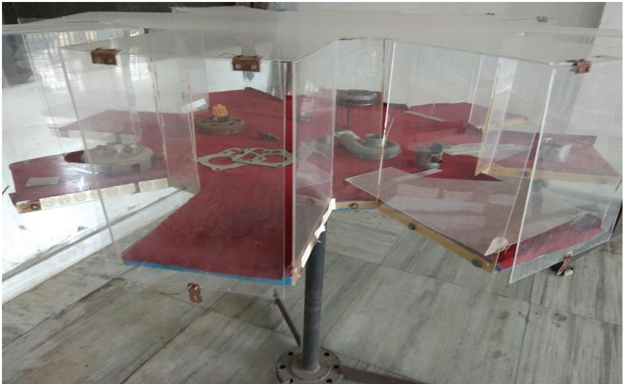
IC Engine Display model-2