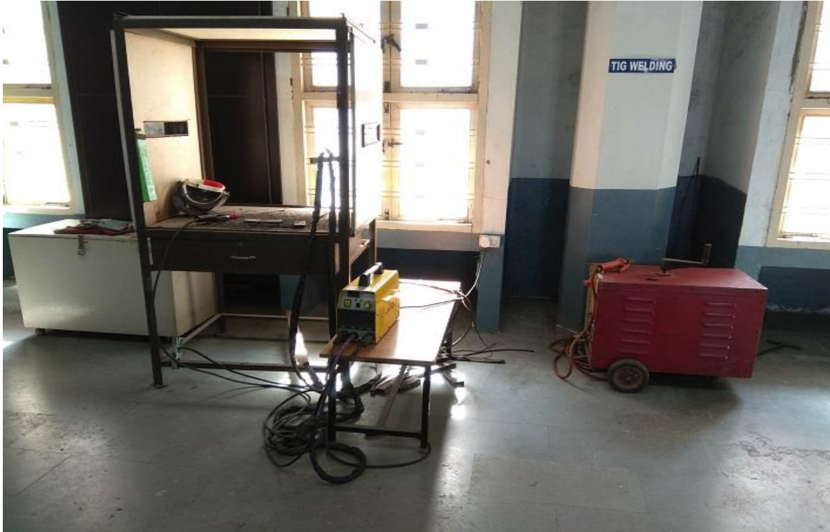
Arc Welding Unit