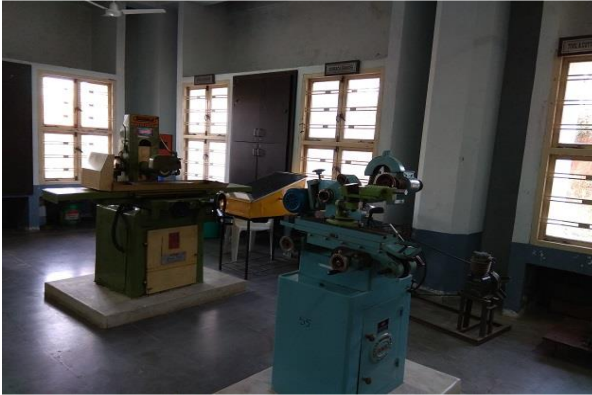
Tool and Cutter Grindg Machine