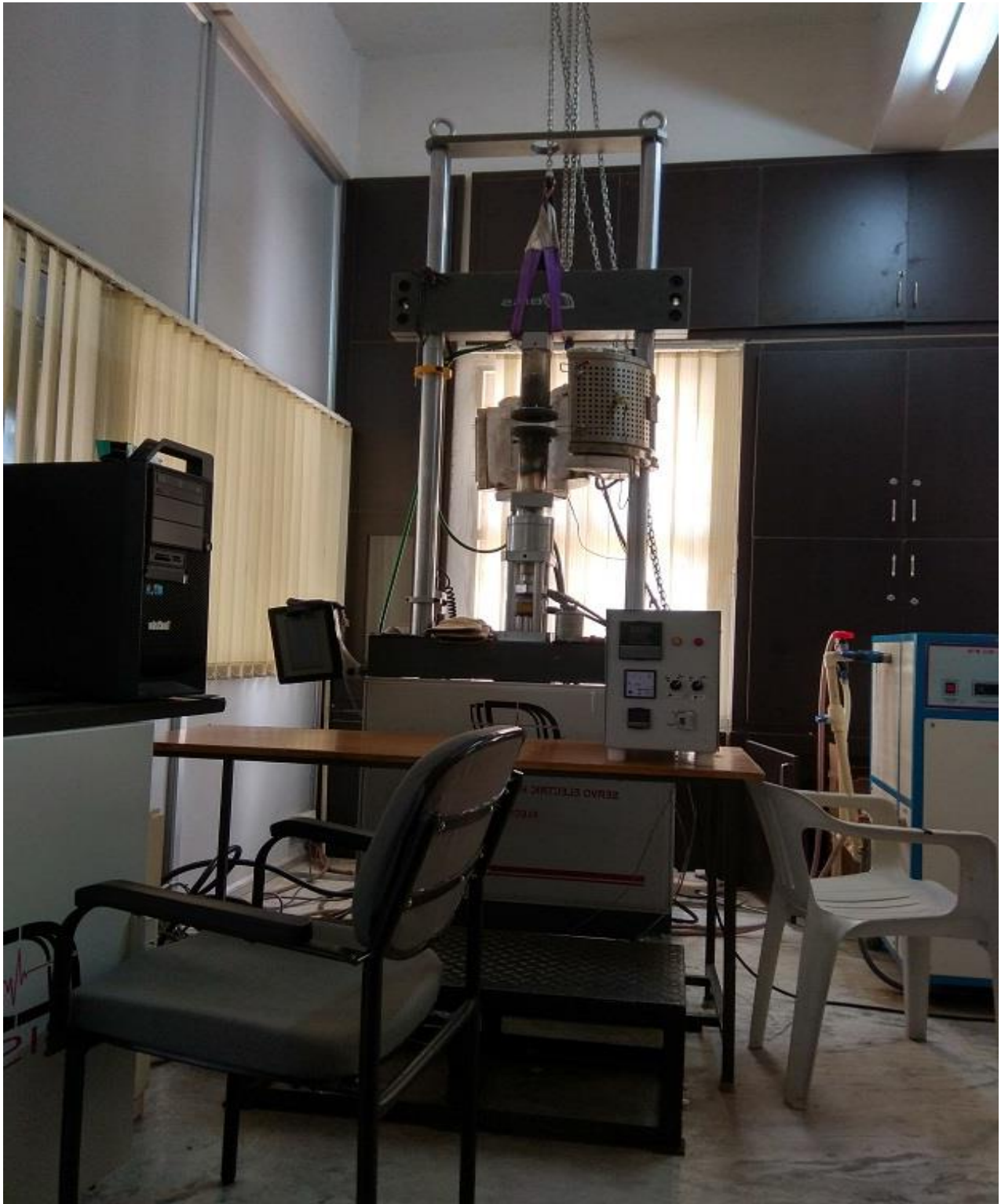
Sheet metal Forming Test Rig