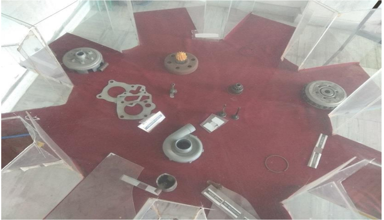
IC Engine Display model-1