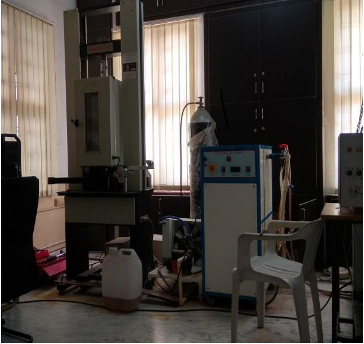
Electronic Universal Testing Machine