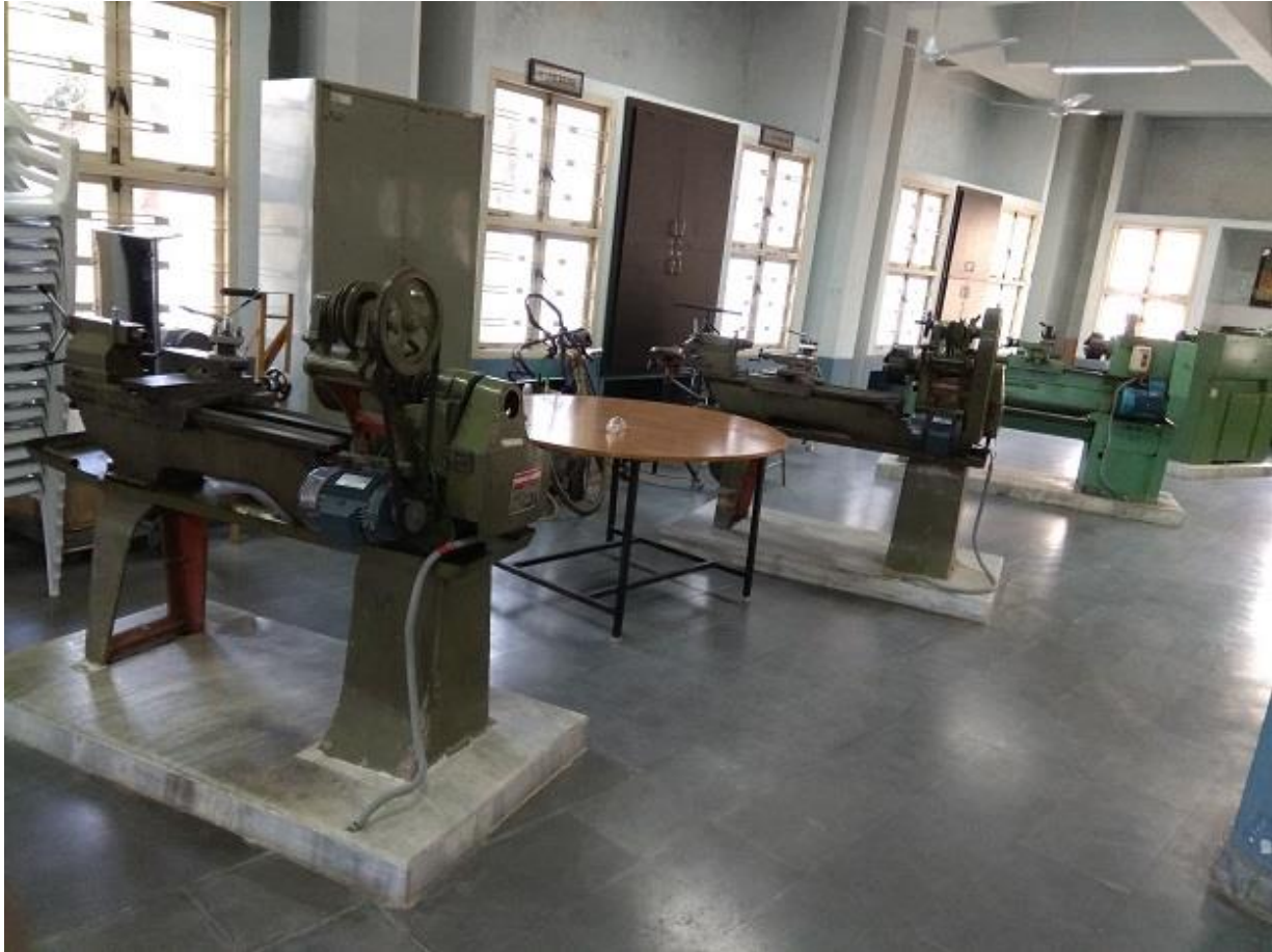
Machine Tools like Turning, Milling, Drilling, Shaping, Slotting and Grinding Machines, etc