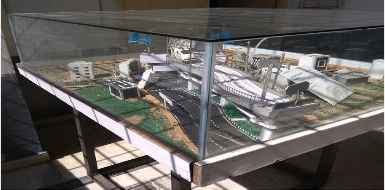
Hyderabad Metro Prototype midel-1