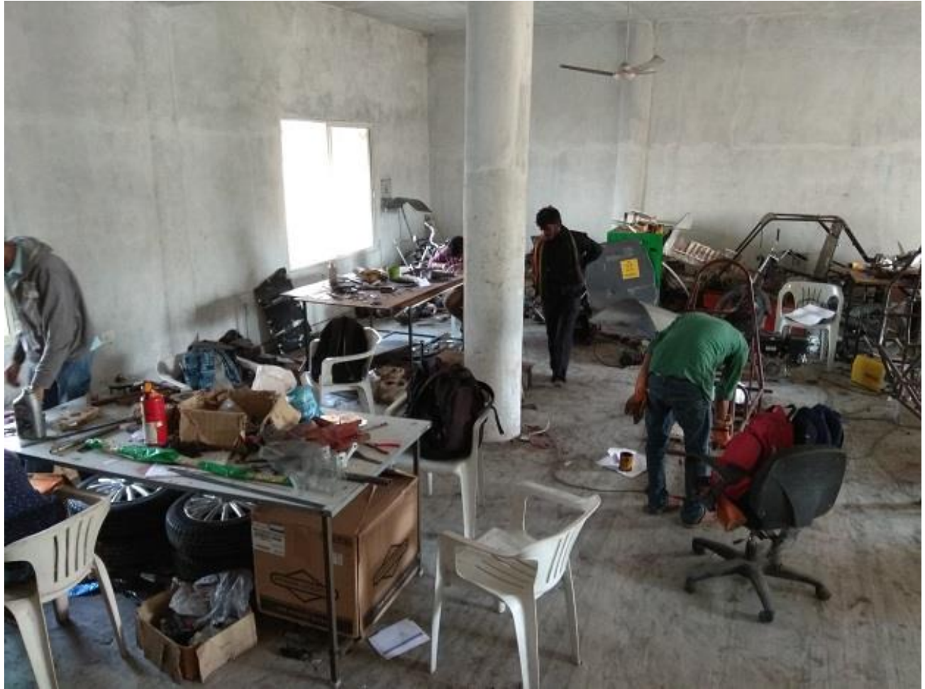
Mechanical Innovation Lab