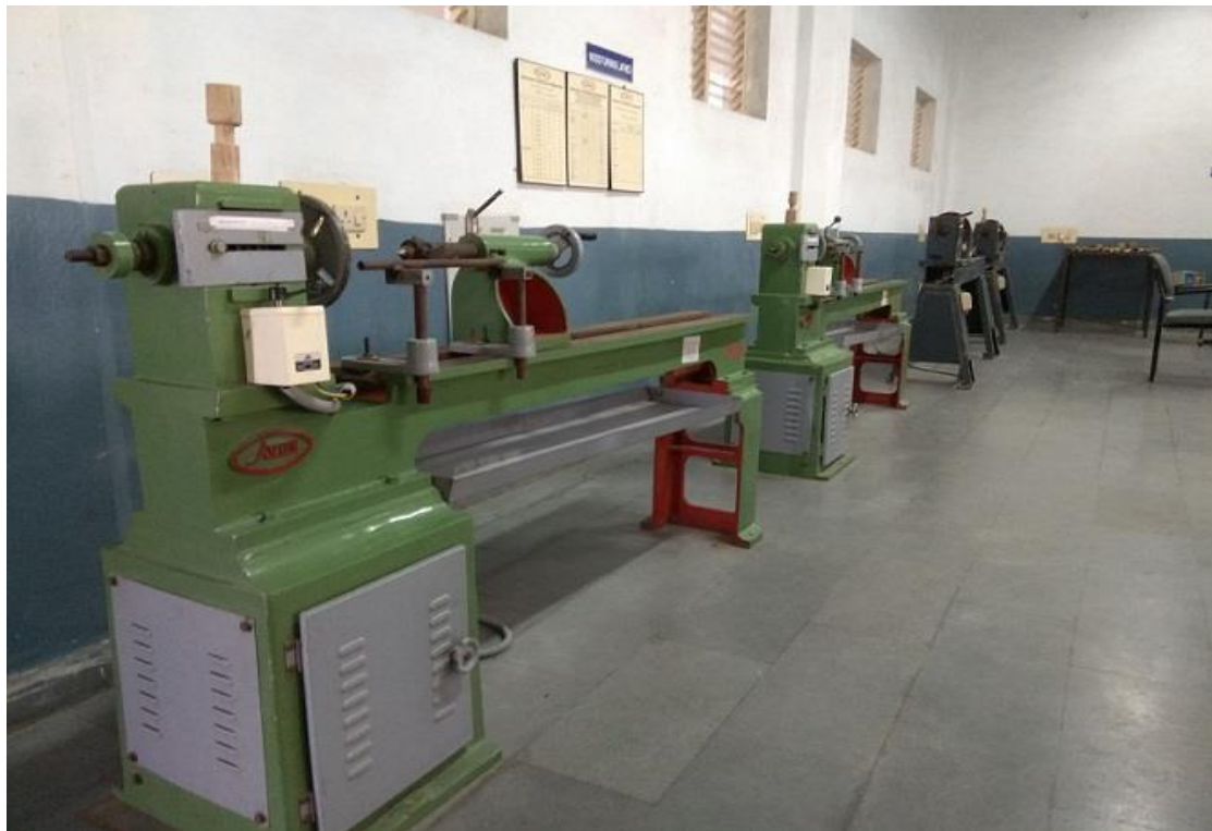
Wood Turning Lathe