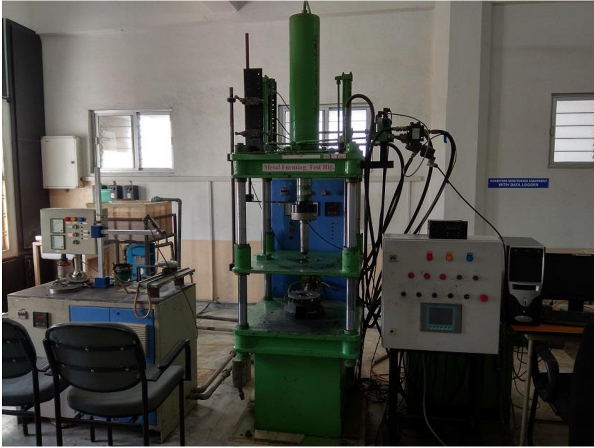
Hydraulic Press with Data Acquisition System