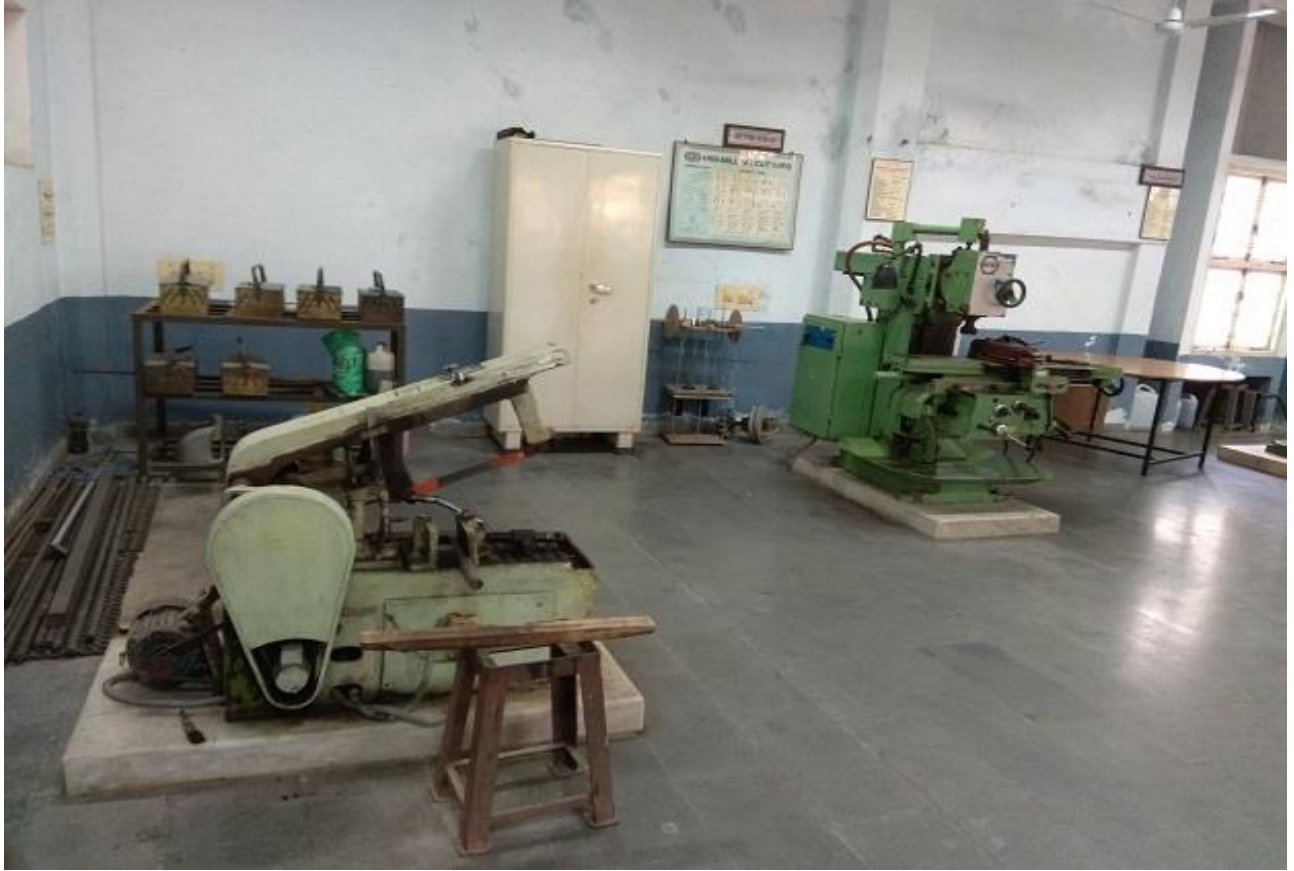
Milling and Hacksaw Machines