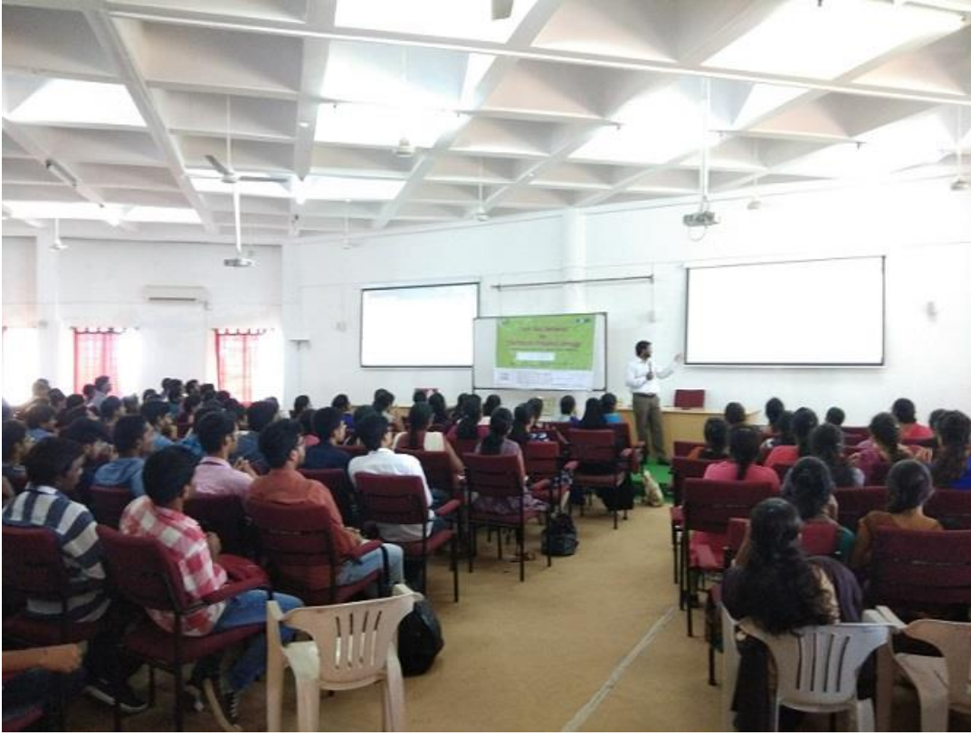
QEEE Lab for ICT Programmes