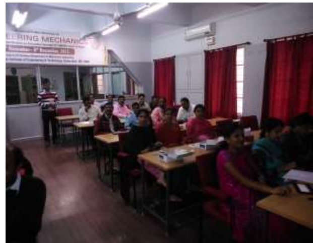
Workshop on Engineering Mechanics (IITB)