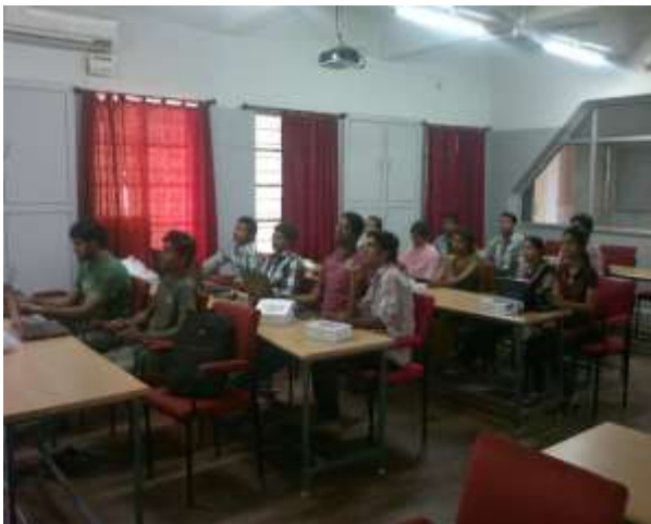
Aakash Android Application Programming (IITB)