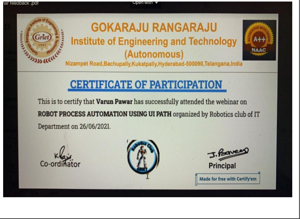
Signature of Coordinator